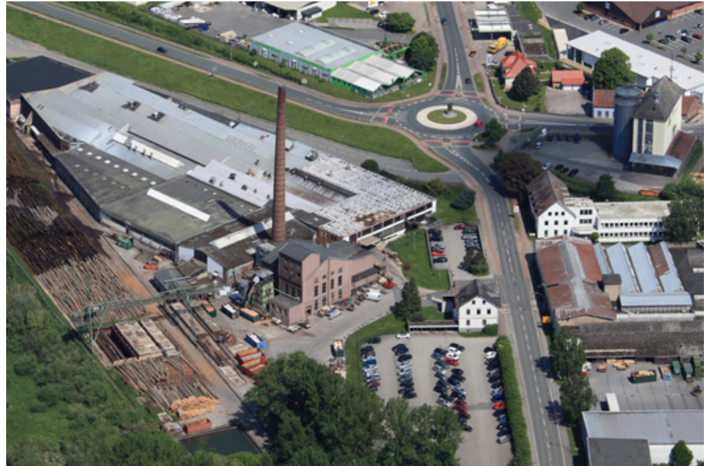
Aerial photograph Blomberger Holzindustrie GmbH

With an industry-wide variety of applications and manufacturing range, Blomberger Holzindustrie GmbH serves numerous other technology sectors, for example: as a worldwide system supplier of reputable rail stock manufacturers. Delignit® solutions have exceptional technical properties and are further, among other things, used as trunk floors, building equipment and security solutions.