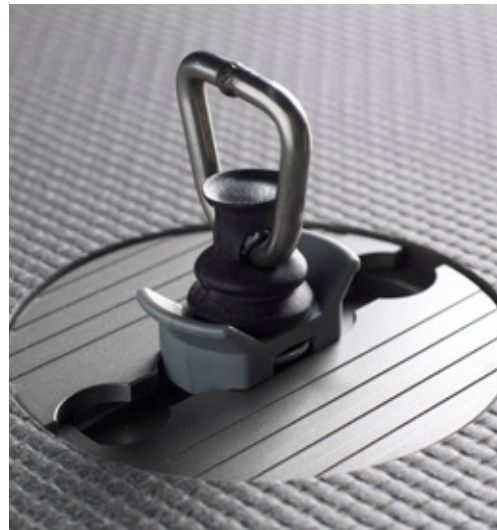
Delignit® Lashing Point