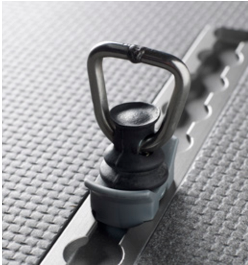
Delignit® Airline rail with system fitting