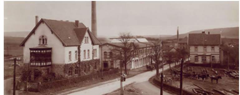
Blumberger Holzindustrie premises at the time of its first expansion; left: office and factory buildings dating from 1907; right: villa built in 1902