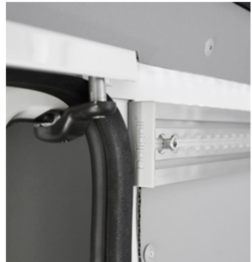
Delignit® Multifunctional Rail